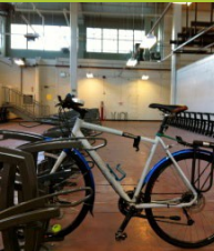
Yoga for Cyclists