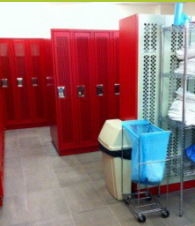
Towels & Lockers